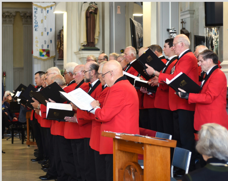
Choir members singing at the Matariki concert July 2023.

Correspondence by email is far more efficient, quicker and cheaper than by ordinary mail!