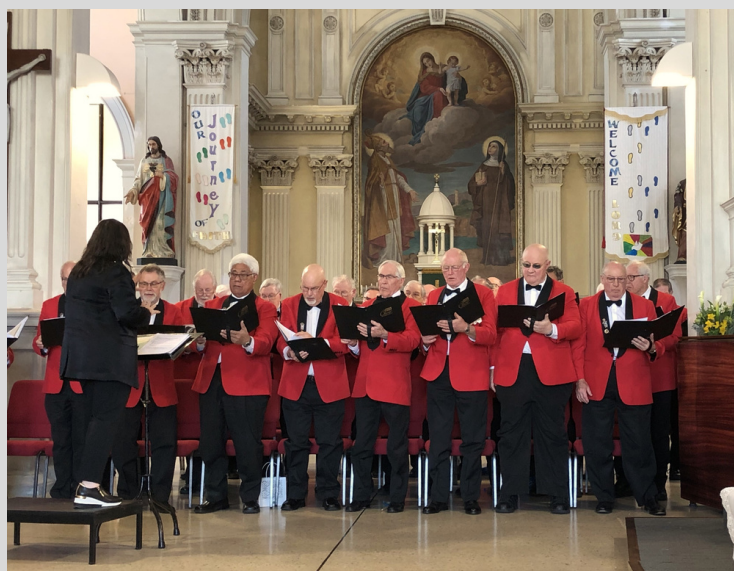
The Choir's front row.

If all the cars in New Zealand were painted pink, what would you have? a PINK CAR-NATION!