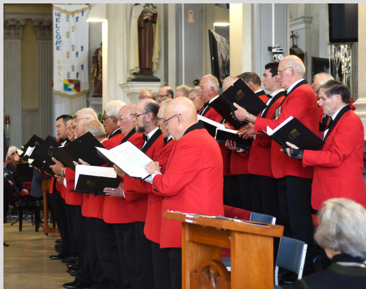
Choir members singing at the Matariki concert July 2023.