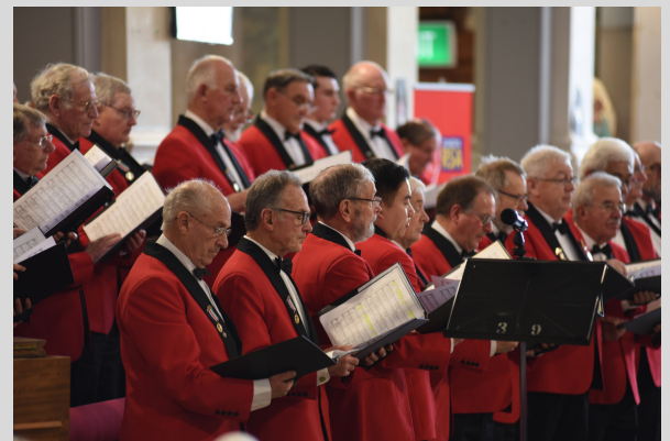
Choir members singing at the Matariki concert July 2023.