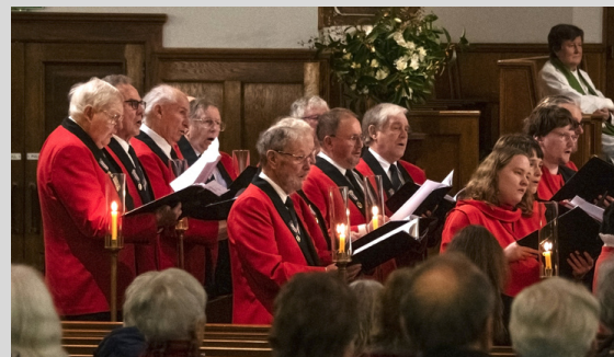
Choir members singing with the Knox Church Choir for the Peace Service in Knox Church.

Westpac 03-0903-0385394-000 , Dunedin RSA Choir. Your donation will be greatly appreciated!