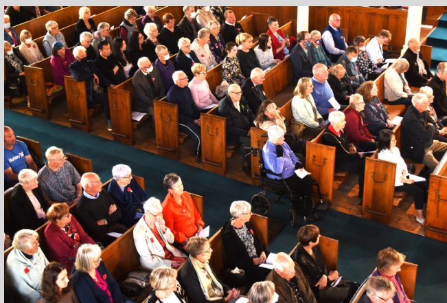
Our Friends at a Knox Church Concert!