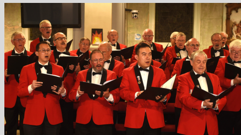
Choir members singing at a concert.

Being a Friend of the RSA Choir entitles you TWO tickets to any one of our public concerts for $50/year. Of course, you can always gift a Friend to a friend! We can never have too many friends.