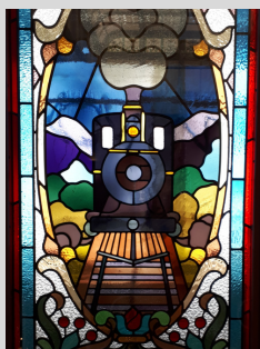
A stained glass window at the Railway station.